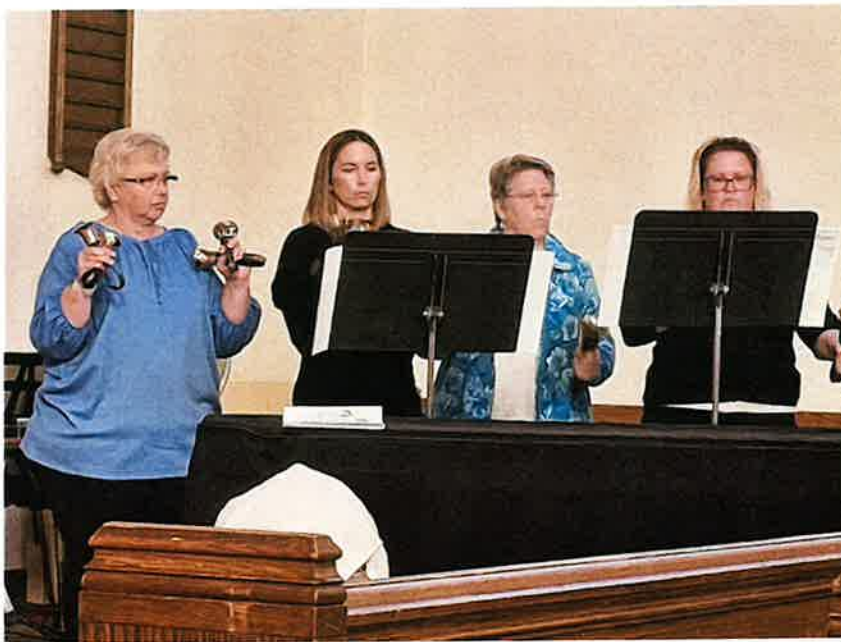
Special Music by First Lutheran Handbells and First Lutheran - Danielson Sisters