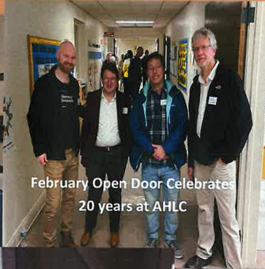
February Open Door Celebrates 20 years at AHLC