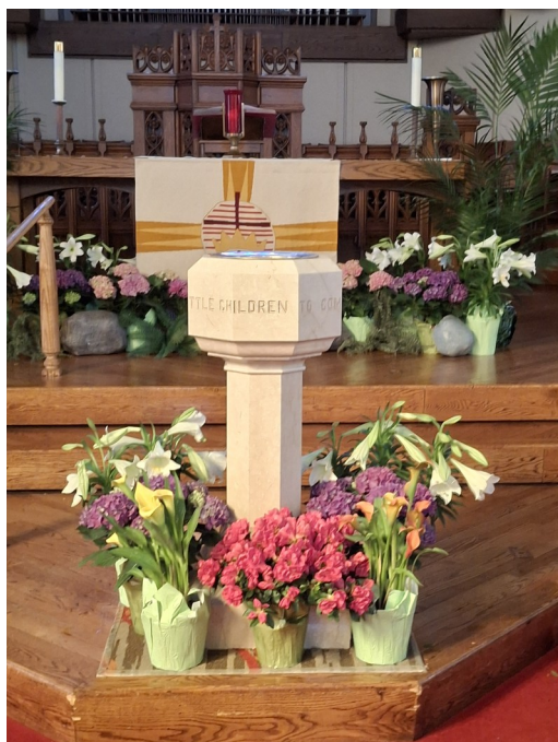
Easter Memorial Garden 2025

https://www.aljazeera.com/gallery/2025/4/20/thousands-gather-for-centuries-old-holy-fire-ceremony-in-jerusalem