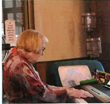
MID-WEEK SOUP AND SCRIPTURES