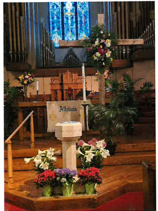
EASTER MEMORIAL GARDEN