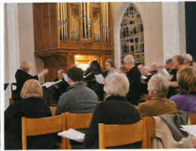
GOOD FRIDAY AT FIRST LUTHERAN